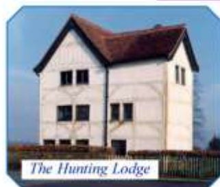
The Hunting Lodge

"Spend a great afternoon with Frank Sinatra"